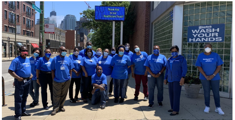
Below: Near North staff at Winfield Moody Health Center located at 1276 N. Clybourn Avenue in Chicago.