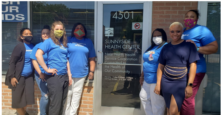
Above: Near North staff outside of Sunnyside Health Center located at 4501 N. Sheridan Road in Chicago.

For more information on Near North's response to COVID-19 and being ALL IN, please visit https://www.nearnorthhealth.org/covid-19 .